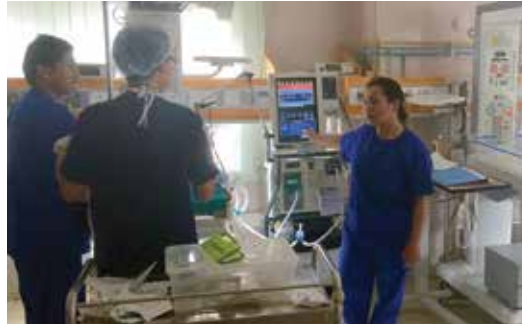
JDWNRH Pediatric Department

To prove our hypothesis, we planned to administer thiamine to these children and observe for an improvement in mortality and morbidity. We adapted a protocol from an Indian study to administer thiamine to suspected patients and presented it to the entire department. Since it is a relatively cheap treatment with virtually no side effects, it was very feasible to deploy the protocol. We received the department's unanimous and instant approval. We collected record-based data of patients with the typical presentation since January 2018. We planned to collect data until the end of December, to statistically analyze the impact of thiamine administration. We collected